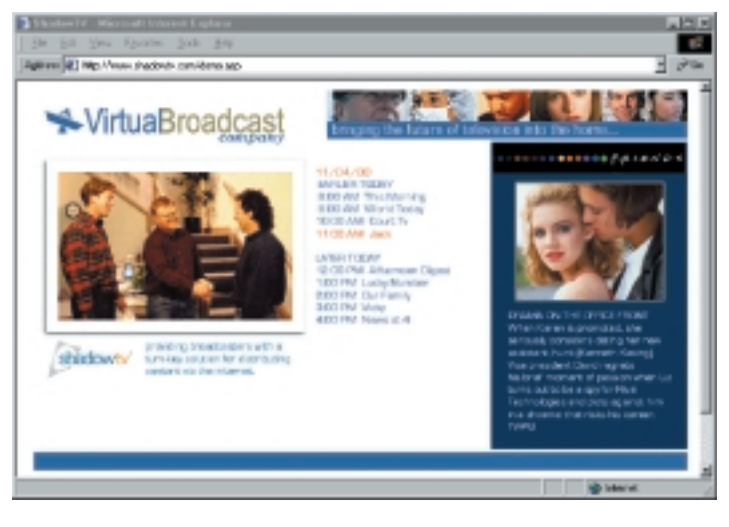
ShadowTV can synchronize content with the videostream to provide interactive opportunities.