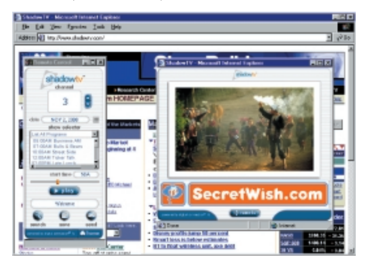
ShadowTV's user interface is designed to work with your current site.

The most effective way to generate new visitors is to provide them with compelling content. And nothing is more compelling than streaming video. But how can you affordably encode, archive and stream your video from your site?